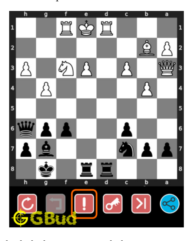
Figure 10: Click the help button to get help on next move @ https://gbud. in/gf22t21