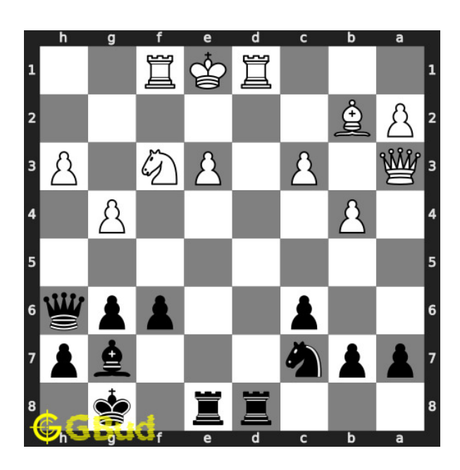
Figure 3: Initial board position of easy chess puzzle 0084

Initial board position This is the initial board position of easy chess puzzle 0084.