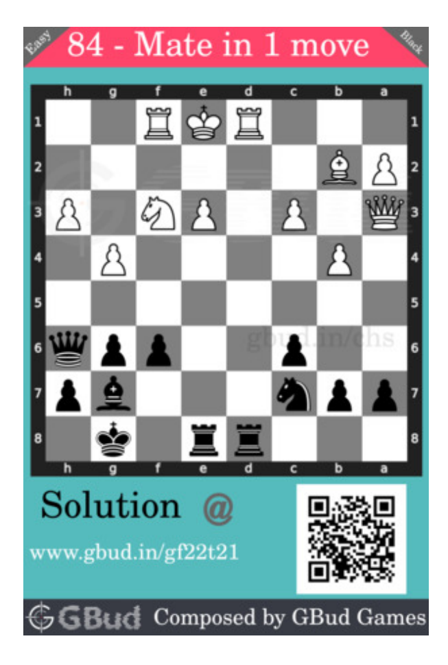
Figure 5: easy chess puzzle 84 chart 1