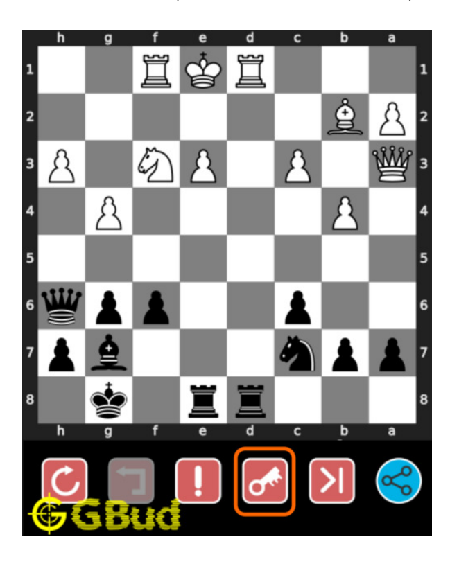
Figure 9: Click the solution button to view solutions @ https://gbud.in/gf22t21