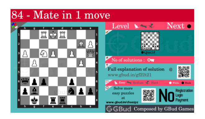
Figure 8: easy chess puzzle 84 chart 4