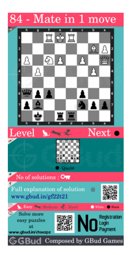
Figure 6: easy chess puzzle 84 chart 2