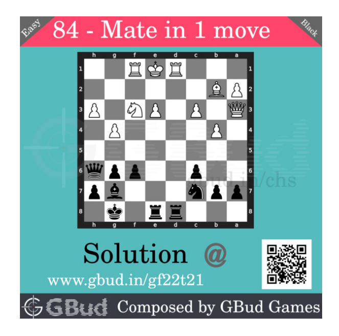
Figure 7: easy chess puzzle 84 chart 3